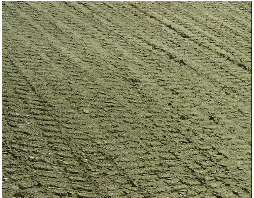
No Shadowing on the Slope