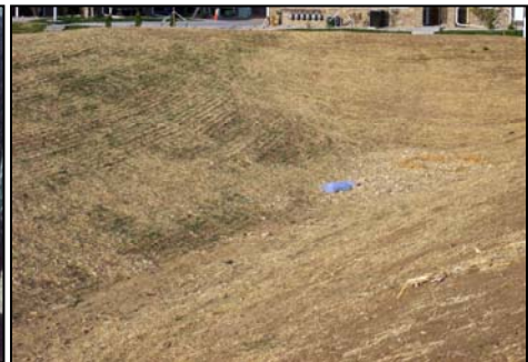
Figure 2. Blown Straw in Detention Pond