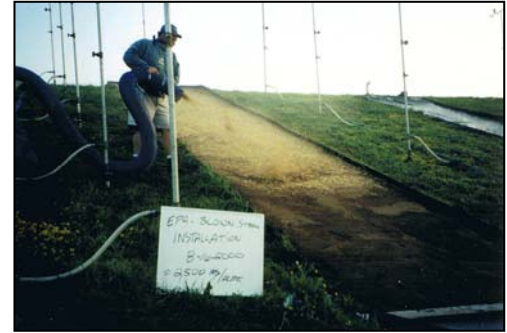
Figure 6. Blown Straw Installed for Testing