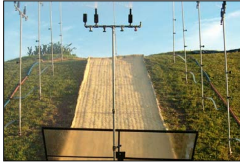
Figure 5. RECP Installed for Testing