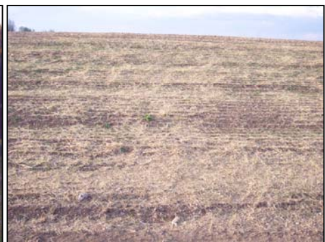
Figure 4. Blown Straw on Slope