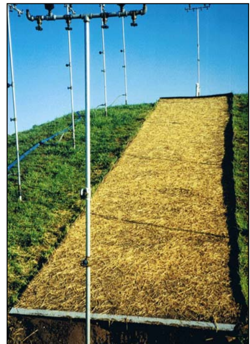
Figure 8. Blown Straw During Testing