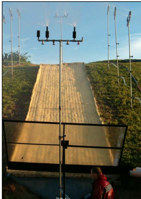
Figure 7. RECP During Testing