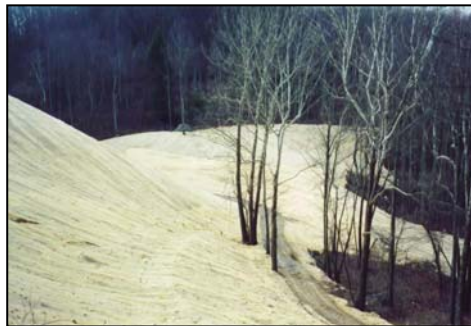
Figure 1. Temporary ECB on Slope