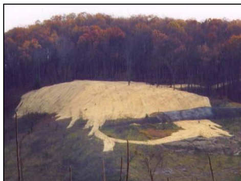
Figure 3. Temporary ECB on Slope