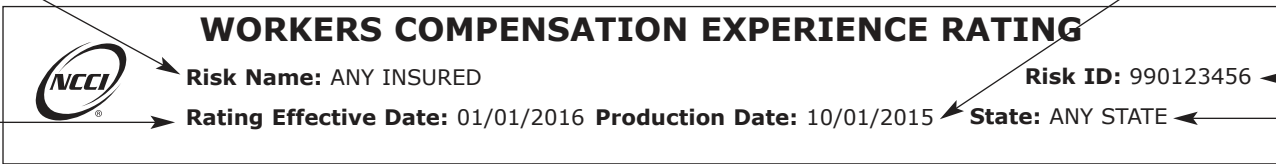
Exhibit F—Page 2 of the Experience Rating Worksheet (DETAILED)

00-ANY STATE Firm ID: Firm Name: ANY INSURED Carrier: 00000 Policy No: 2012UNIT Eff Date: 01/01/2012 Exp Date: 01/01/2013