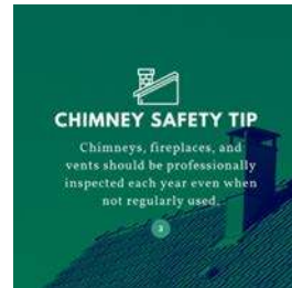
See Live Example

Share video-based stories of yourself explaining insurance tips for secondary product lines: engagement rings, personal property, recreational vehicles.