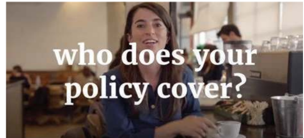
See Live Example

Share text-based carousel graphics with seasonal maintenance tips for home and car.