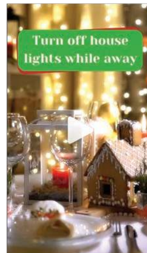
See Live Example