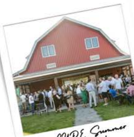
CYPE Summer Social