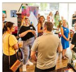
May Sip Series Hugs in a Mug