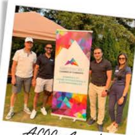
ACOC Annual Golf Tournament