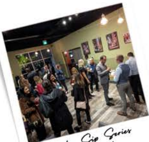
November Sip Series Afterthoughts