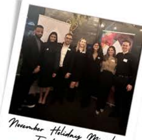
November Holiday Mingler Trading Post