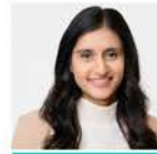
SAM VARING CHAIR