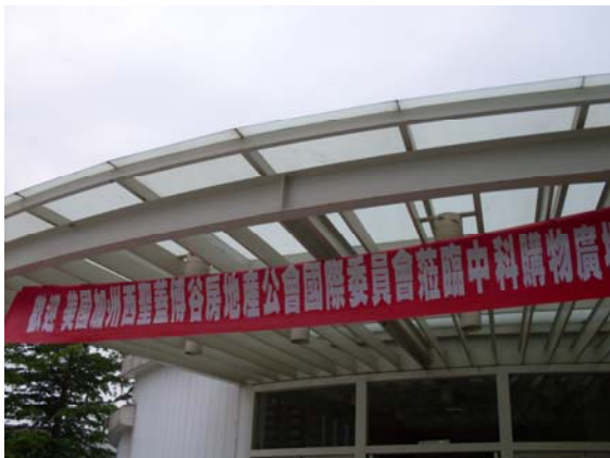
April 01, 2010 – Tai-Chung City The Tech Mall Shopping Mall Project developed by Sheng Gung Real Estate Development Co.