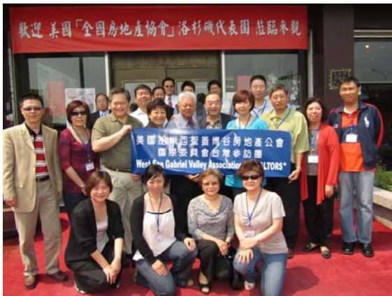
March 31, 2010 – Tao-Yuan City Ching Pu Station – The City Foresight Residential Project developed by Yi-Tseng Development Co.