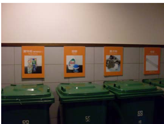
April 01, 2010 – Tai-Chung City The Lu-Shing-Fu Residential Project's on-site waste processing center. This project has been awarded the Green Community Development Project Award. Project developed by Da-Yi Development Co.