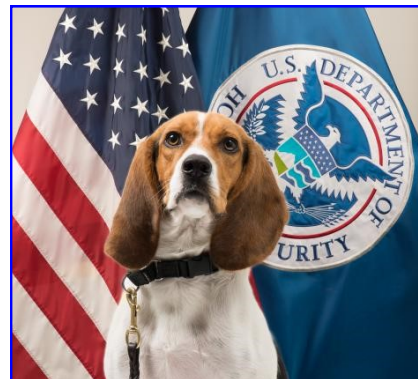
"Beagle Brigade" member Hardy's official photo.

USDA is committed to working closely with the swine industry and producers to ensure strict biosecurity procedures are in place and being followed on all swine farms.