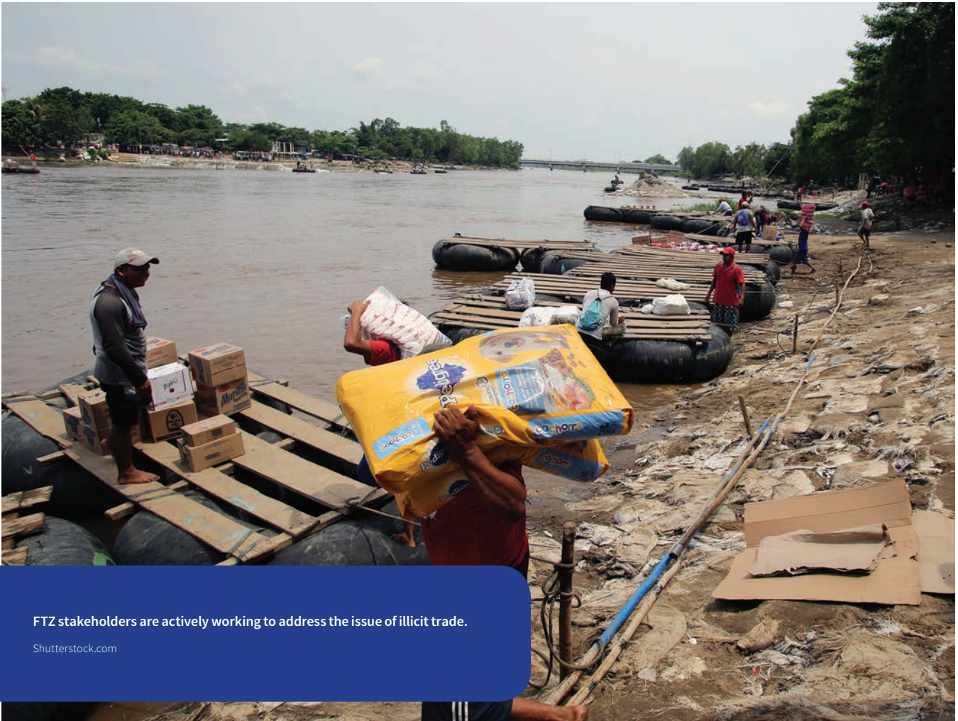
FTZ stakeholders are actively working to address the issue of illicit trade.