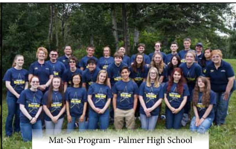
Mat-Su Program - Palmer High School