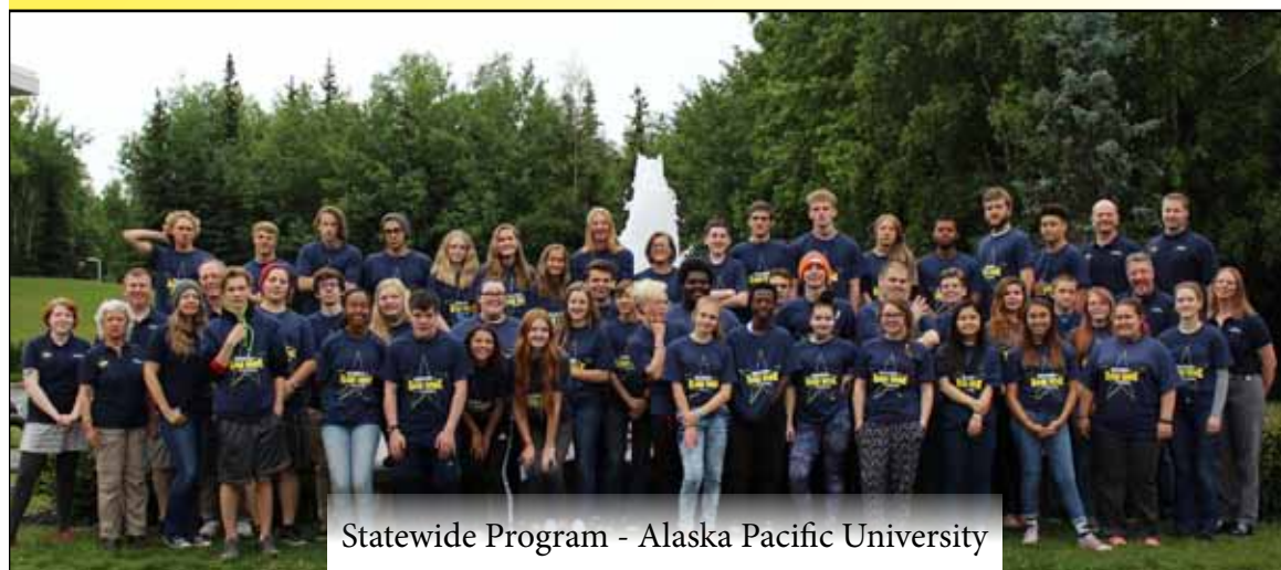
Statewide Program - Alaska Pacific University