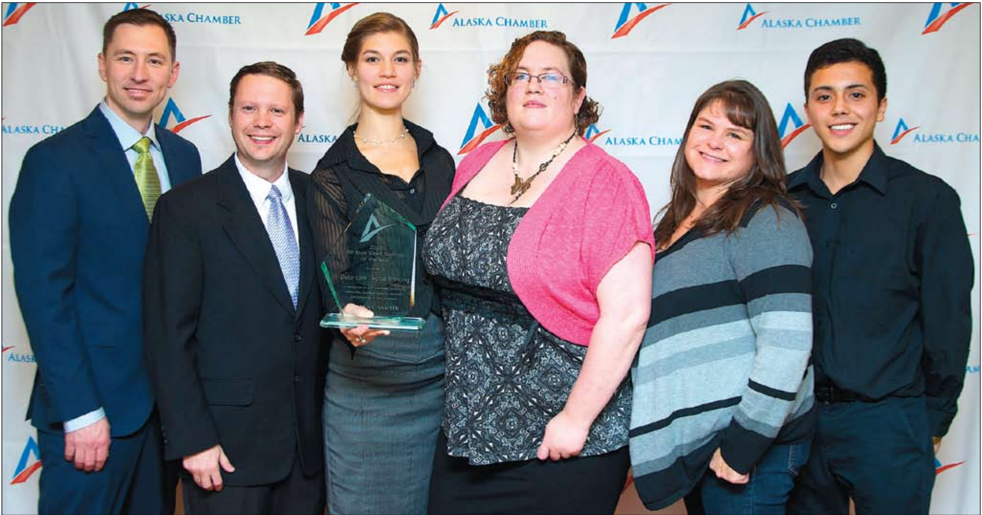
Bill Bivins Small Business of the Year: Date-Line Digital Printing

The recipients for the Bill Bivins Small Business of the Year, Local Chamber of Commerce of the Year, William A. Egan Alaskan of the Year and North Star Award were announced on Wednesday, October 14 at the Alaska Chamber’s annual Awards Gala in Fairbanks, Alaska.