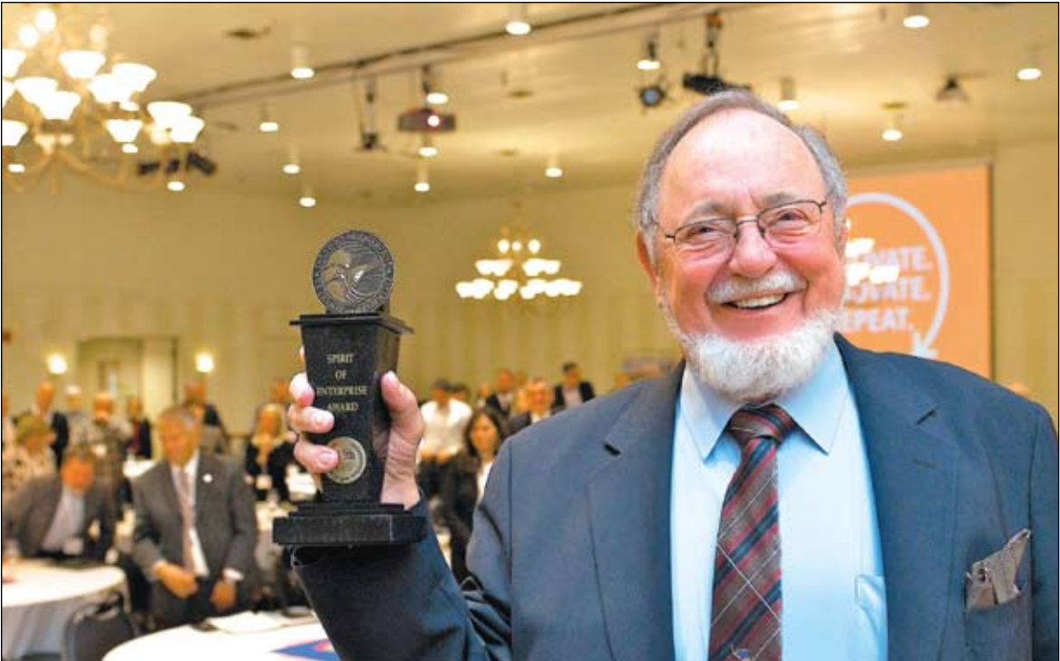
Alaska U.S. Rep. Don Young shows off his Spirit of Enterprise award from the U.S. Chamber of Commerce.

Alaska businesses, however, are aligned on both state and federal issues. Our workers and employers will continue to capitalize on opportunities in our free markets. And the Chamber is committed to champion the cause of fiscal sustainability and pro-business reform.