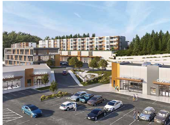
Artist's rendition of the Outlook Village and Wren + Raven Hillside Homes project now being developed on Lougheed Highway across from Mission RCMP Station. To learn more about the Elevate Development Corp. project, click on ElevateCorp.ca.