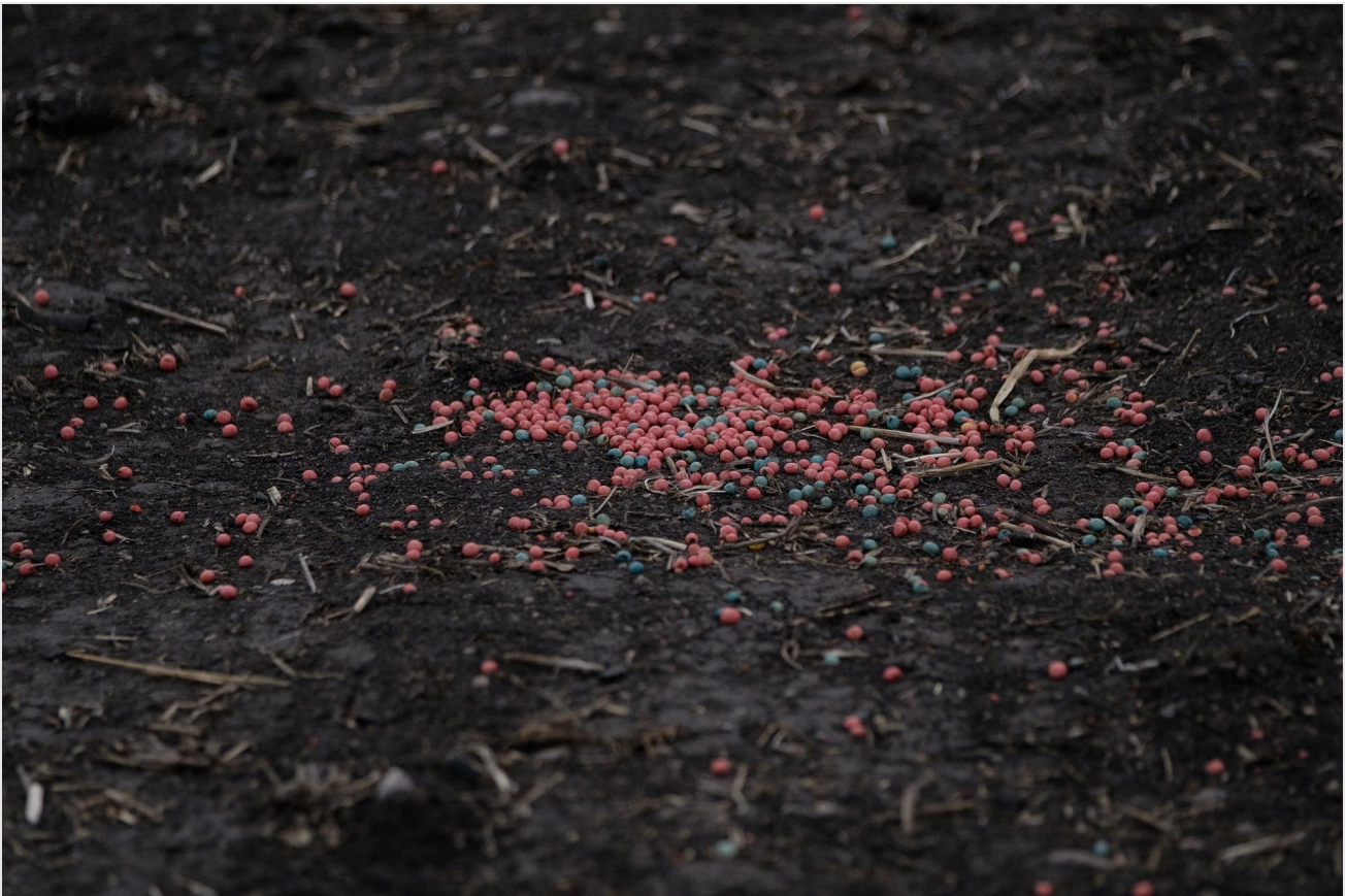
Spilled seed on the edge of a field near the Tympanuchus WMA.