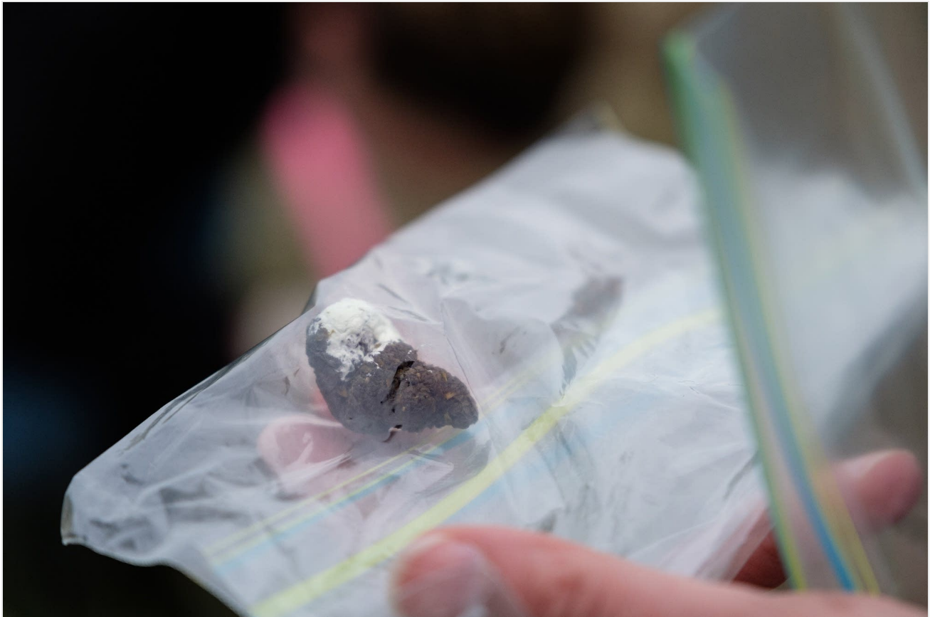
Charlotte Roy holds a bagged pellet sample.

In a statement, Syngenta said, "Neonicotinoids are an essential crop protection tool for farmers and, when used according to the label, safe for the environment." The company added that it works to "educate farmers on the proper stewardship of treated seed to minimize the risk of exposure to non-target organisms, like pollinators, birds and other wildlife. Tags on Syngenta treated-seed bags direct users to "cover or collect treated seeds spilled during loading" to prevent or minimize exposure to wildlife."