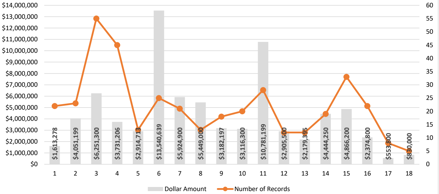
Dollar Amount vs Number of Records

Legend: Dollar Amount (Grey Bar), Number of Records (Orange Line)