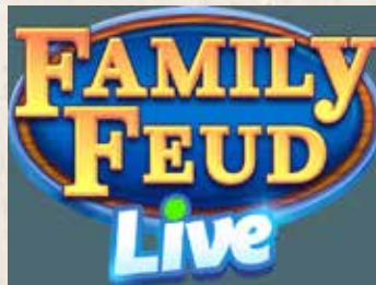
UVCA CHIRO FAMILY EDITION

A great opportunity to break bread with your colleagues, clients and prospects in a relaxed setting. Recognize the new officers and others who have gone the extra mile. Take your chance at raffle prizes to benefit the UVCA's Legal/Legislative Fund, and participate in or watch a hilarious fast-paced game show patterned after the ultra-hit Family Feud! And after the games, a professional DJ will spin tunes for your dancing and listening enjoyment! $68 per ticket. (Level 2 Exhibitor/Function Sponsor registration includes 2 tickets.)