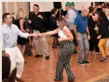
PLUS PROFESSIONAL DJ