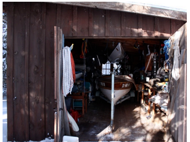
The Boathouse, home to the Eisenhower papers for nearly 50 years.