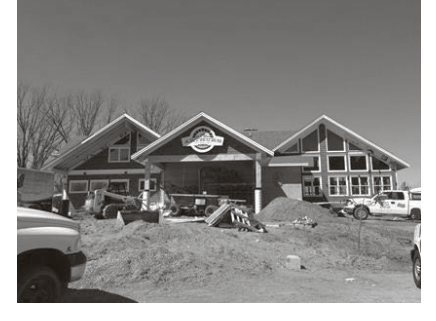
Construction approaches completion on April 22nd

Those who are interested in the course of construction of the