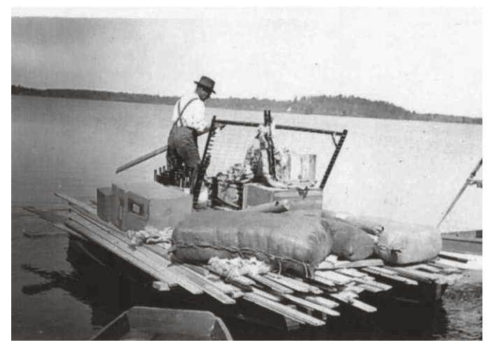
Floating building materials over to Boone Point from the railroad station at the end of Long's Bay, 1916. It took until 4:30pm to load the rafts and then until 7:45pm to pilot them to the Point. Individual in the photo is probably Gudmundson, one of Ball's fellow teachers in Boone who took the trip to Ten Mile to meet the train and help transport the materials

The government offered the land for sale late in 1914, and Ball moved quickly to purchase sixteen acres and named it Boone Point. The following summer, June 1915, Ball and friends from Boone, Iowa had furniture, cabinetry, and lumber delivered by train to the station at the south end of Long's Bay. They built rafts and traversed down Long's Bay to the new property for building the first cabins on Boone Point.