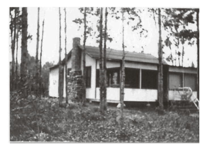
Original Ball family cabin in 1918

people in that "little cabin." The retreat participants still have fond memories of the rustic, no-running-water facilities they had to endure, and also the many games that were played in the lake, the front vard, and in the cabin.