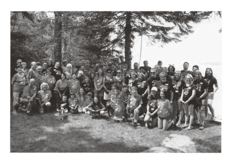
Boone Point & Ball Family Reunion on Boone Point, July 4, 2015

Boone Point residents added a twist to their Independence Day festivities by celebrating one hundred years on Ten Mile Lake. The centennial celebration reunited over fifty descendants of the original residents, in addition to more recent Boone Point property owners. The joyous occasion was filled with photos and memoirs, burying of a time capsule, and sharing of family stories.