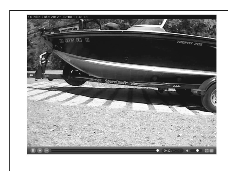
I-LIDS frame at Ten Mile Lake Access

And remember, we REALLY need volunteers! So sign up to be an inspector-educator TODAY and join our team to help keep Ten Mile pure and pristine for our children and grandchildren.