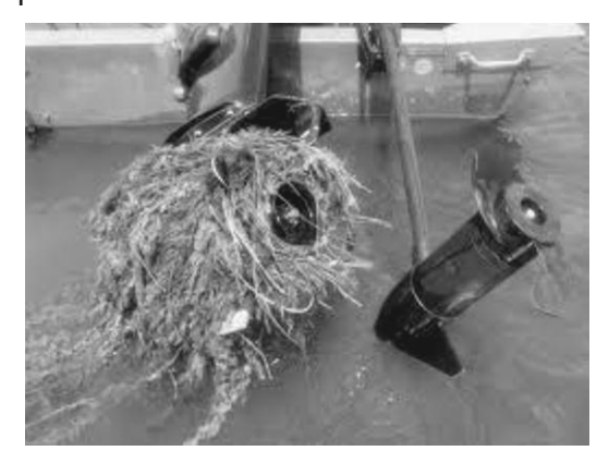
Eurasian Water Milfoil

By now, you've received (and hopefully, read!) the letter sent to all Ten Mile Lake property owners concerning Aquatic Invasive Species (AIS). Over the years, most of us have heard about Eurasian Water Milfoil and probably about zebra mussels. Eurasian Water Milfoil forms thick mats of vegetation that make boating and swimming difficult or even impossible.