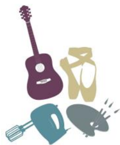
Paul Nigra Center for Creative Arts