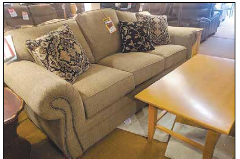
A broad range of styles, quality and pricing makes Livingston's accessible to everyone.