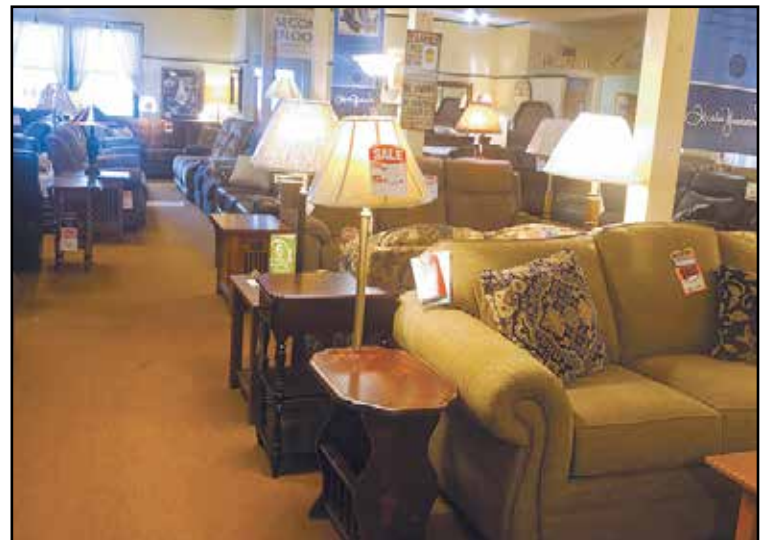
The showroom at Gloversville features 3 floors so that customers can truly experience the furniture before purchasing.