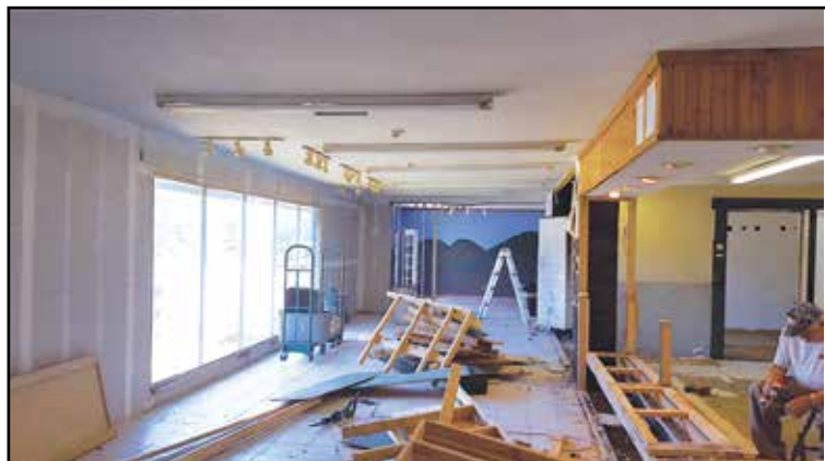
Renovations are underway at the new location of Frank's Gun & Tackle Shop in Vail Mills. After 35 years at the existing location, the new space will allow for expansion of current inventory, as well as the sale of new product lines.

Frank's has been the local provider of guns & ammo; archery equipment; fishing sup-