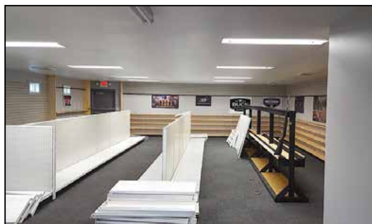
A view of the renovations in progress for the new gun display and sales area at the new location of Frank's Gun & Tackle Shop.

plies; reloading equipment; clothing; live bait; hunting and fishing licenses; and accessories for the sportsman, since 1984. They also providing gunsmithing on premises.