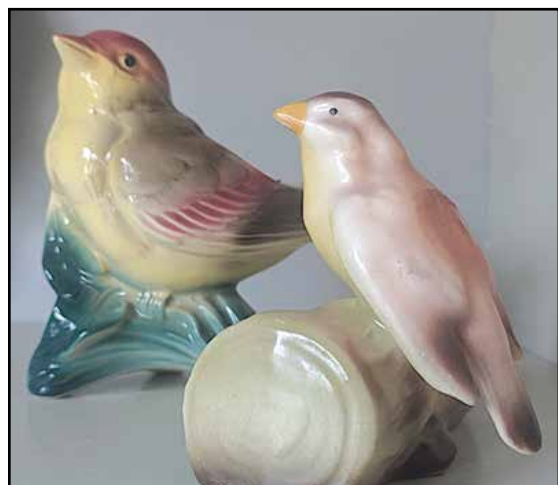
Vendors at the Southern Adirondack Antiques and Collectibles Festival, scheduled for Labor Day weekend at Fulton County Airport in Johnstown, might just offer some treasures like these to enthusiastic antique-lovers.

The 2019 event marks the first time a festival of this kind has been planned in Fulton County. It is sponsored by Fulton County, NY and the Fulton Montgomery Regional Chamber of Commerce. The show will be held outdoors at the Fulton County, NY Airport, 160 Airport Road, Johnstown, and organizers have a goal of securing at least 60 vendors. Single outdoor booths will be 20' x 22', and double and triple booth spaces are also available.