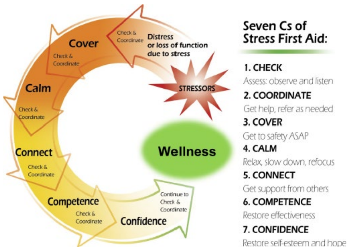
Figure 2: The Stress First Aid Model's Core Actions

Stress First Aid is based on a set of five evidence-based elements that have been linked to better functioning after stress and adversity in a number of settings. These elements are: (1) regaining a sense of safety, or cover , (2) restoring calm , to reduce intense physiological arousal and negative emotions, (3) feeling connected to sources of social support, (4) increasing the sense of efficacy, which means feeling competent to handle the situations that create stress (on one's own or as a team) or one's own reactions to the stress, and (5) experiencing hope or confidence in one's self and the world.