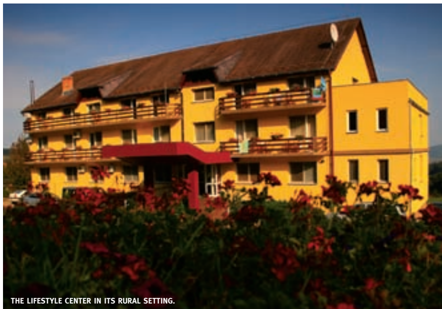
THE LIFESTYLE CENTER IN ITS RURAL SETTING.

Herghelia is an example of how the medical missionary work can combine with the ministry.