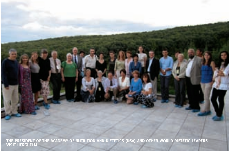
THE PRESIDENT OF THE ACADEMY OF NUTRITION AND DIETETICS (USA) AND OTHER WORLD DIETETIC LEADERS VISIT HERGHELIA.