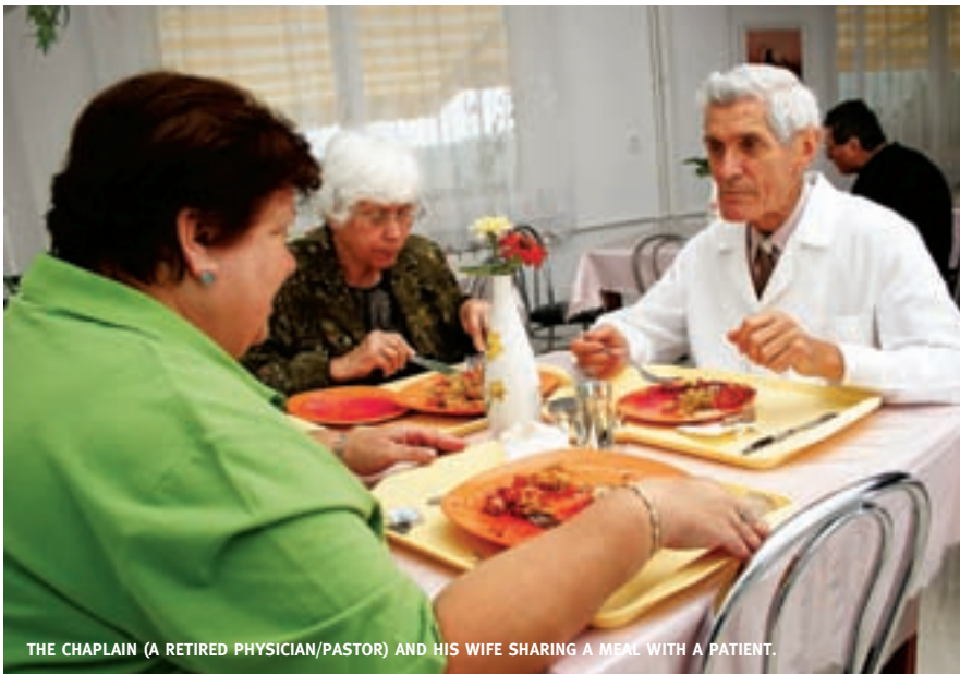
THE CHAPLAIN (A RETIRED PHYSICIAN/PASTOR) AND HIS WIFE SHARING A MEAL WITH A PATIENT.

50/50 with the SDA Romanian Union. About 8500 are distributed each month throughout Romania. It is also a powerful entering wedge for SDA colporteurs.