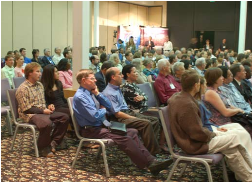
Over 200 physicians and dentists attended the 2 nd annual AMEN conference.