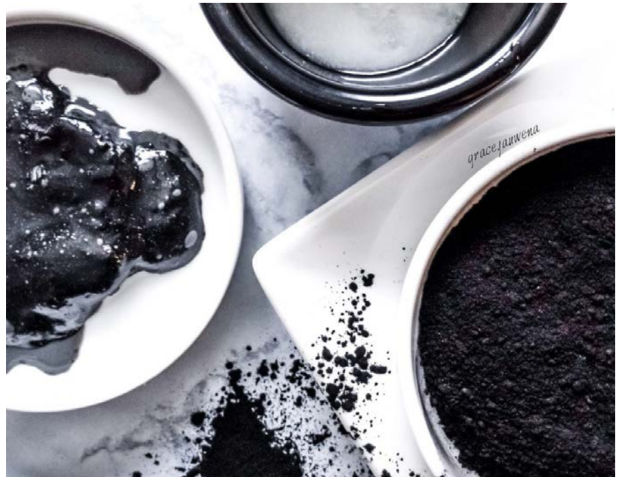
Life and Health Network