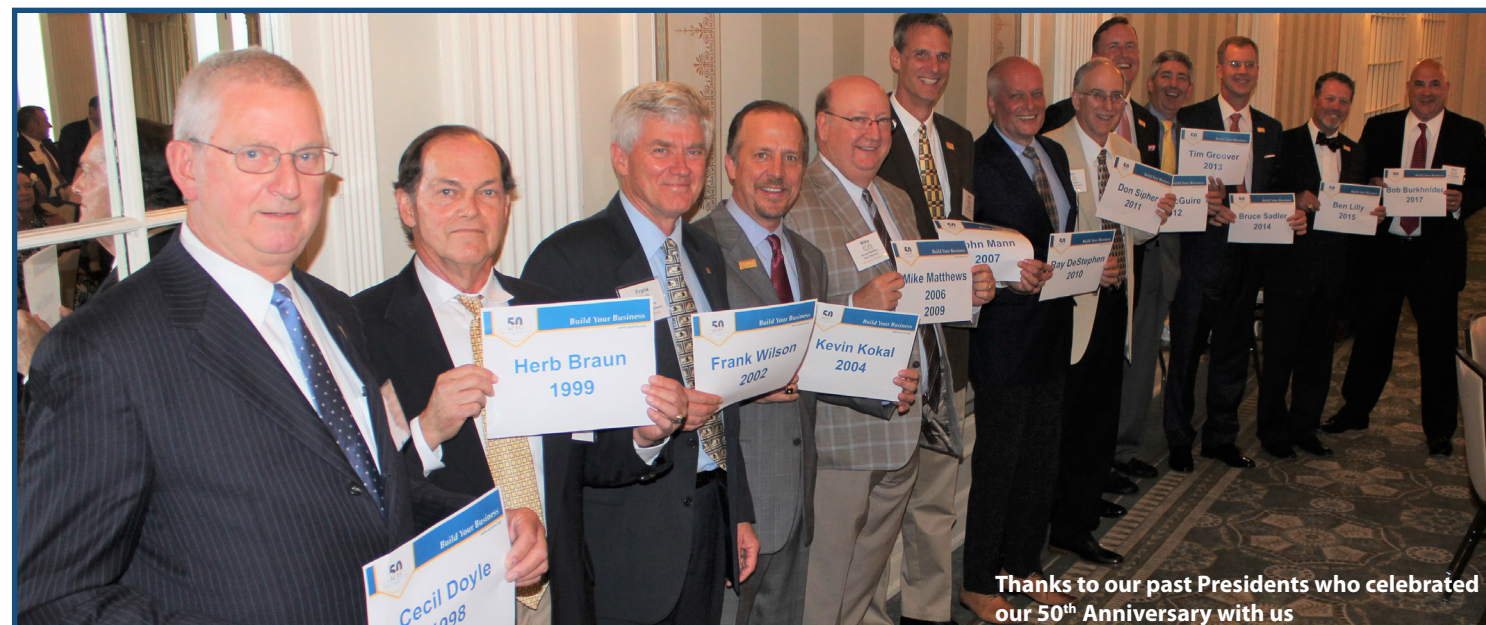
Thanks to our past Presidents who celebrated our 50 th Anniversary with us