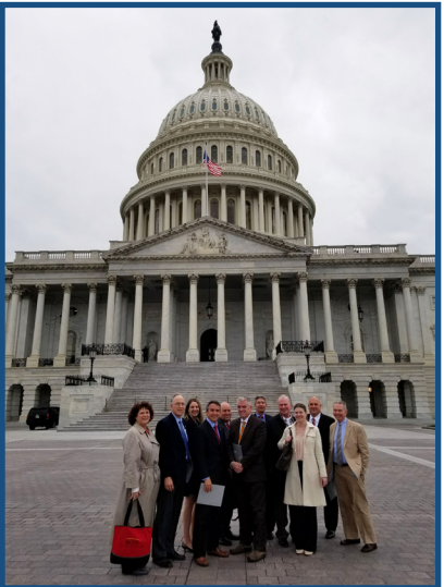
ACEC Virginia participating in Hill Visits