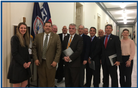
ACEC Virginia meeting with Congressman Garrett

With the margin in the House and Senate so close, expect a ton of cash to be spent in