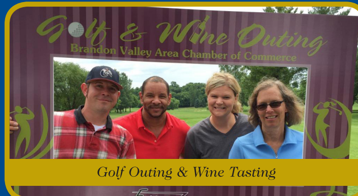
Golf Outing & Wine Tasting