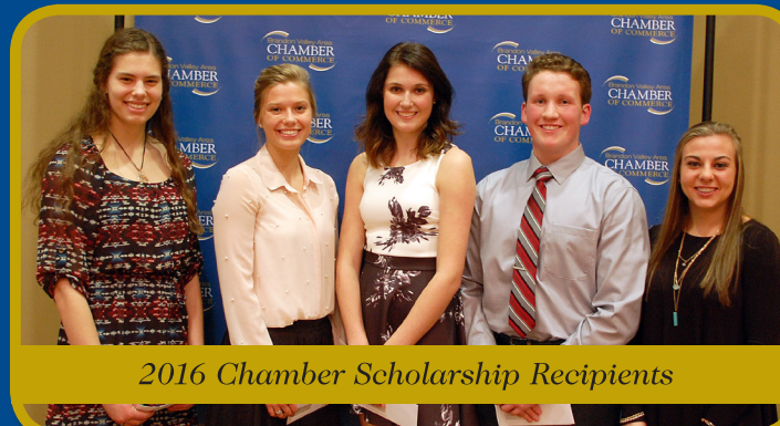
2016 Chamber Scholarship Recipients