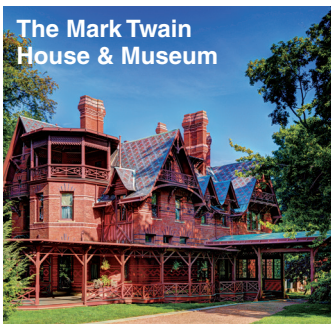
The Mark Twain House & Museum