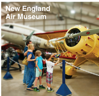
New England Air Museum