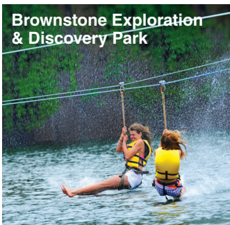
Brownstone Exploration & Discovery Park