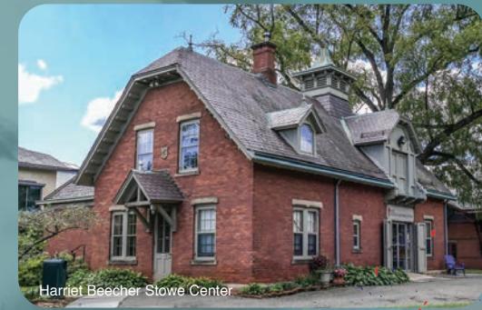
Harriet Beecher Stowe Center