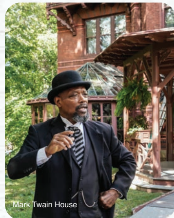
Mark Twain House

Daniel Benton Homestead (c.1720) 154 Metcalf Rd. Tolland (860) 872-7716 tollandhistorical.org