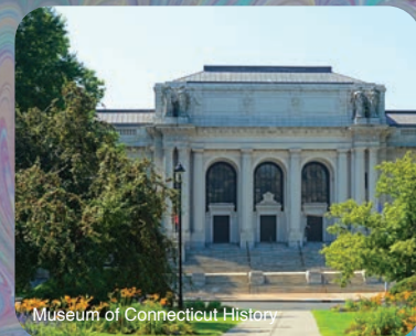
Museum of Connecticut History