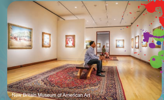
New Britain Museum of American Art