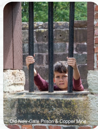
Old New-Gate Prison & Copper Mine

Hicks-Stearns Family Museum 42 Tolland Green Tolland (860) 875-7552 historicbuildingsct.com/the-hicks-stearns-family-museum-1788