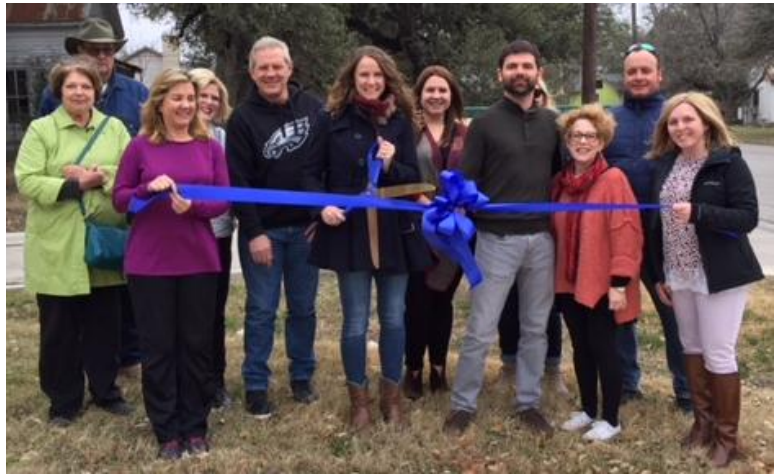
Starry Day Designs