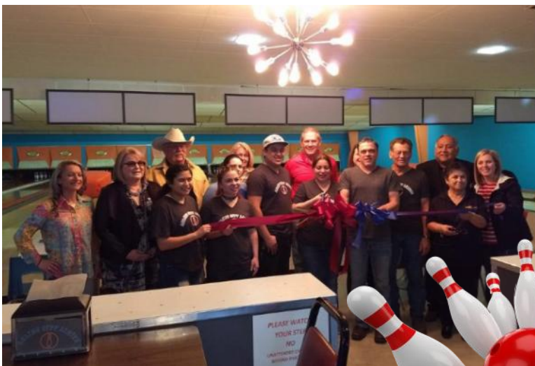
Luling City Limits