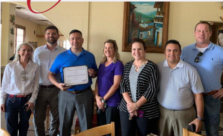
Member of the Month Guadalajara Mexican Restaurant