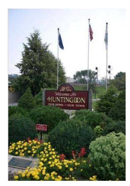
An independent foundation, established by the Huntingdon County Chamber of Commerce for the benefit of the Huntingdon County community.