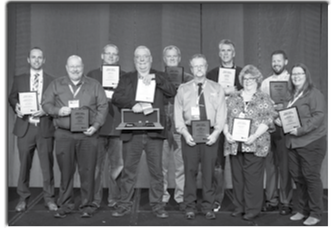
Fleet Safety Awards