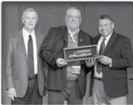
Fleet Grand Champion – TMI Transport Corp.