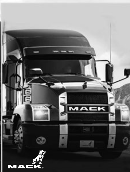
THE ALL NEW MACK ANTHEM™

THE RIGHT TRUCK MAKES ALL THE DIFFERENCE