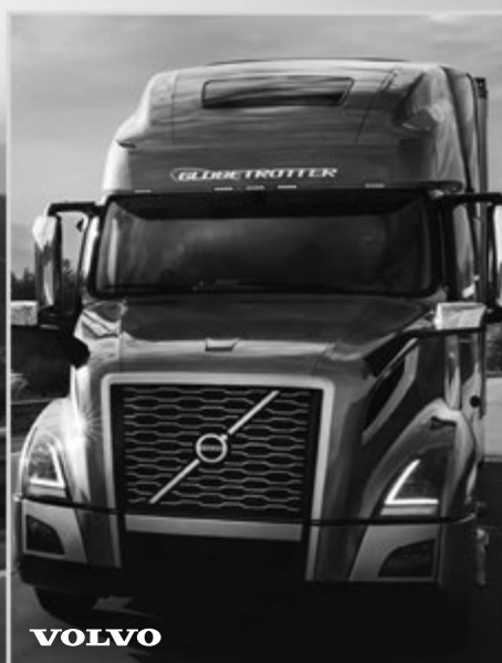
THE NEW VOLVO VNL™