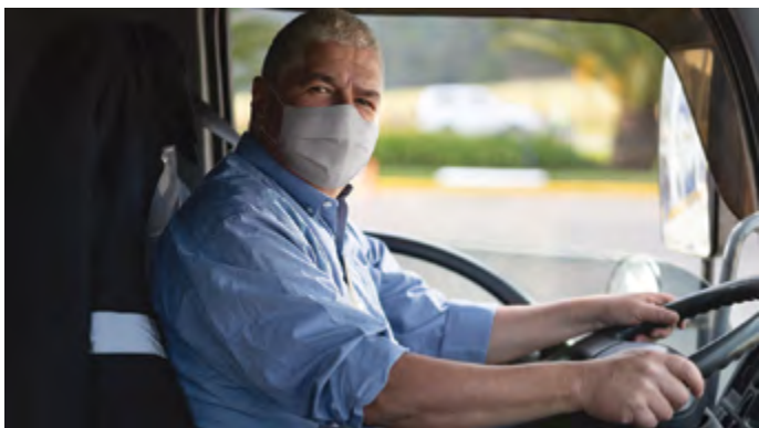
A truck driver wears a mask. American Trucking Associations in a Dec. 11 letter asked congressional leaders to include provisions on the matter of liability protection for truckers.

As lawmakers work on legislation that will provide additional relief funds to the transportation sector, the trucking industry is asking Congress to include provisions that ensure liability protection for motor carriers on the front lines of the coronavirus relief effort.