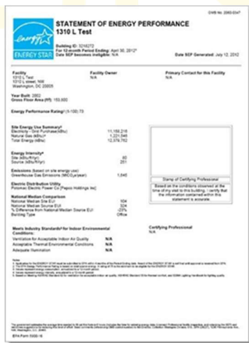
(Does not need to be stamped by an engineer.)