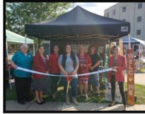
Cows, Kids, & Chaos www.facebook.com/cowskidschaosCC