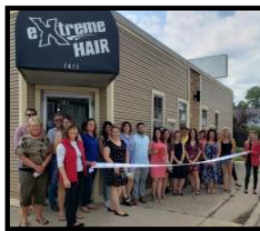
Wellspring Medical Spa Inside Extreme Hair and Day Spa at 1411 E 4th St. Sterling 815-973-7916