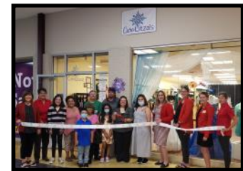
Caro Litza's Suite 20F, Northland Mall 2900 E Lincolnway, Sterling (815) 441-3185