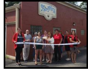
Air Play Espresso and Bakery Drive Thru Location 202 4th Avenue, Sterling