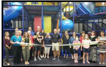
Westwood Fitness and Sports Center Kids Gym and Party Rental 1900 Westwood Drive, Sterling 815-622-6201