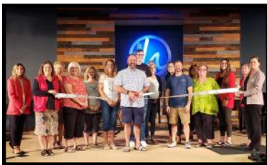
Harvest Time Bible Church 1802 Dixon Avenue, Rock Falls 815-626-1234