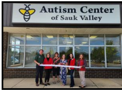
Autism Center of Sauk Valley 1319 N. Galena Ave., Dixon 815-440-6134.