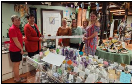
Saged Souls 1510 Prophetstown Rd, Rock Falls 815-535-3510