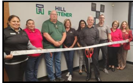
Hill Fastener 1602 McNeil Rd., Rock Falls 815-625-6600