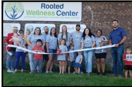
Rooted Wellness Center 3101 Freeport Rd., Sterling 815-590-5483