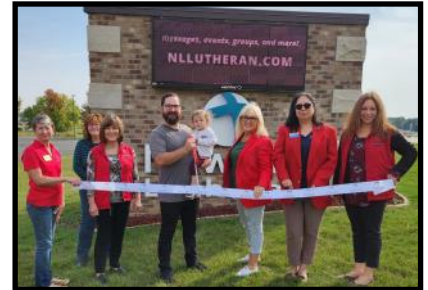
New Life Lutheran Church 702 W. Lynn Blvd, Sterling 815-499-6552