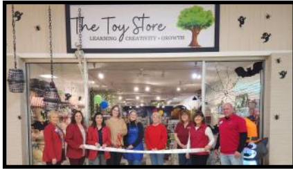
The Toy Store Northland Mall—Sterling (815) 622-5996