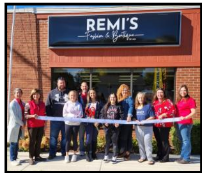
REMI'S Fashion & Boutique 711 N Brinton Ave, Dixon (815) 994-4277