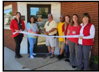
Chuck Wagon 1201 E 4th St, Sterling (815) 213-7207