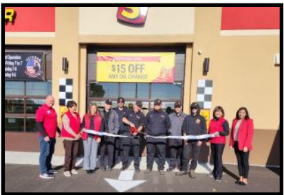
Take 5 Oil Change 4106 E. Lincolnway, Sterling (815) 213-7765