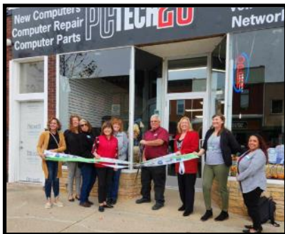
PC Tech 2U 106 N 2nd St , Rock Falls (815) 564-2300