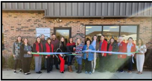
In Home Personal Services 110 E. Lynn Blvd Suite B, Sterling (815) 997-2606