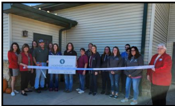
Northern Illinois Veterinary Services 651 Otter Creek Drive, Milledgeville (815) 225-7127