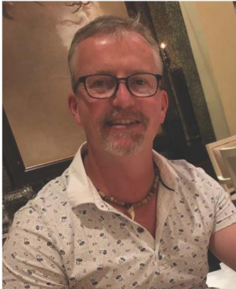
The Short Cut?