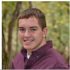
Paul Sturtevant Highland Community College Ag Scholarship