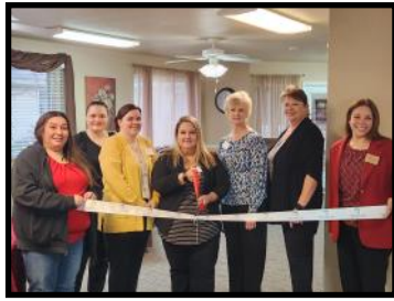
Avonlea Cottages Memory Care 2201 E. LeFevre, Sterling (815) 626-5686