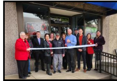
Regional Media—new location! 308 Locust St., Sterling (815) 625-3400