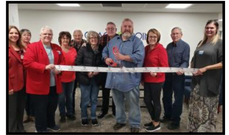
Grace Point Church 1620 Sauk Rd., Dixon (815) 288-1142