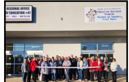
Regional Office of Education #47 2214 E. 4th St., Sterling (815) 625-1495