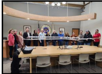
Surf Internet—Dixon (888) 274-6381