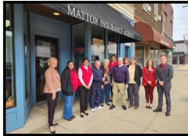
“passing of the torch” Mattox Insurance Agency 208 E. Third St., Sterling (815) 626-5751