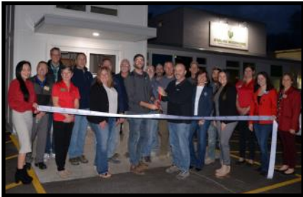
Sterling Woodworks 1307 W 4th St., Sterling (815) 426-9328