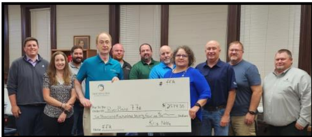
SVACC Agri-business Committee presented a check to the River Bend Schools FFA program to support ag education.