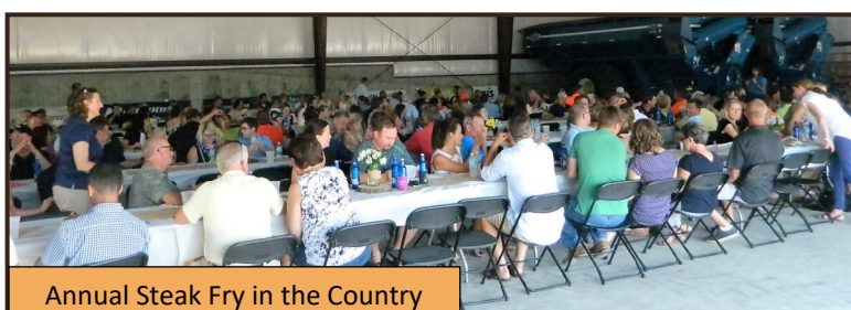
Annual Steak Fry in the Country