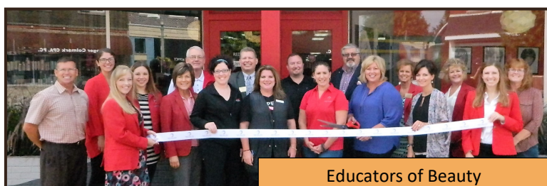
Educators of Beauty