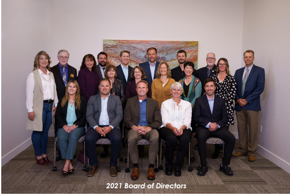
2021 Board of Directors