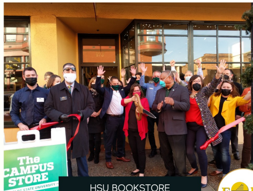
HSU BOOKSTORE RIBBON CUTTING