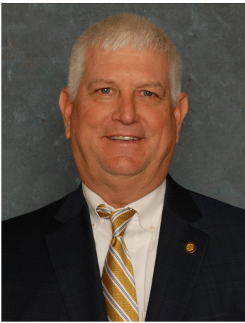
Senator David Sessions Alabama State Senate District 35