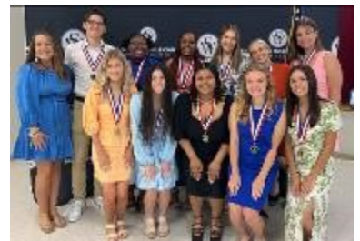
Class of 2024 We wish you all the best!