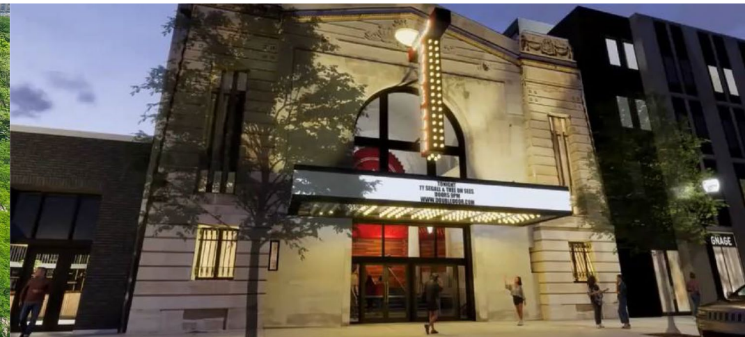
BREAKING GROUND SOON: In restoring the Wilson Theater, the Double Door will build out a music venue with two mezzanine levels while a bank vault in the basement will be turned into a lounge with a bar.