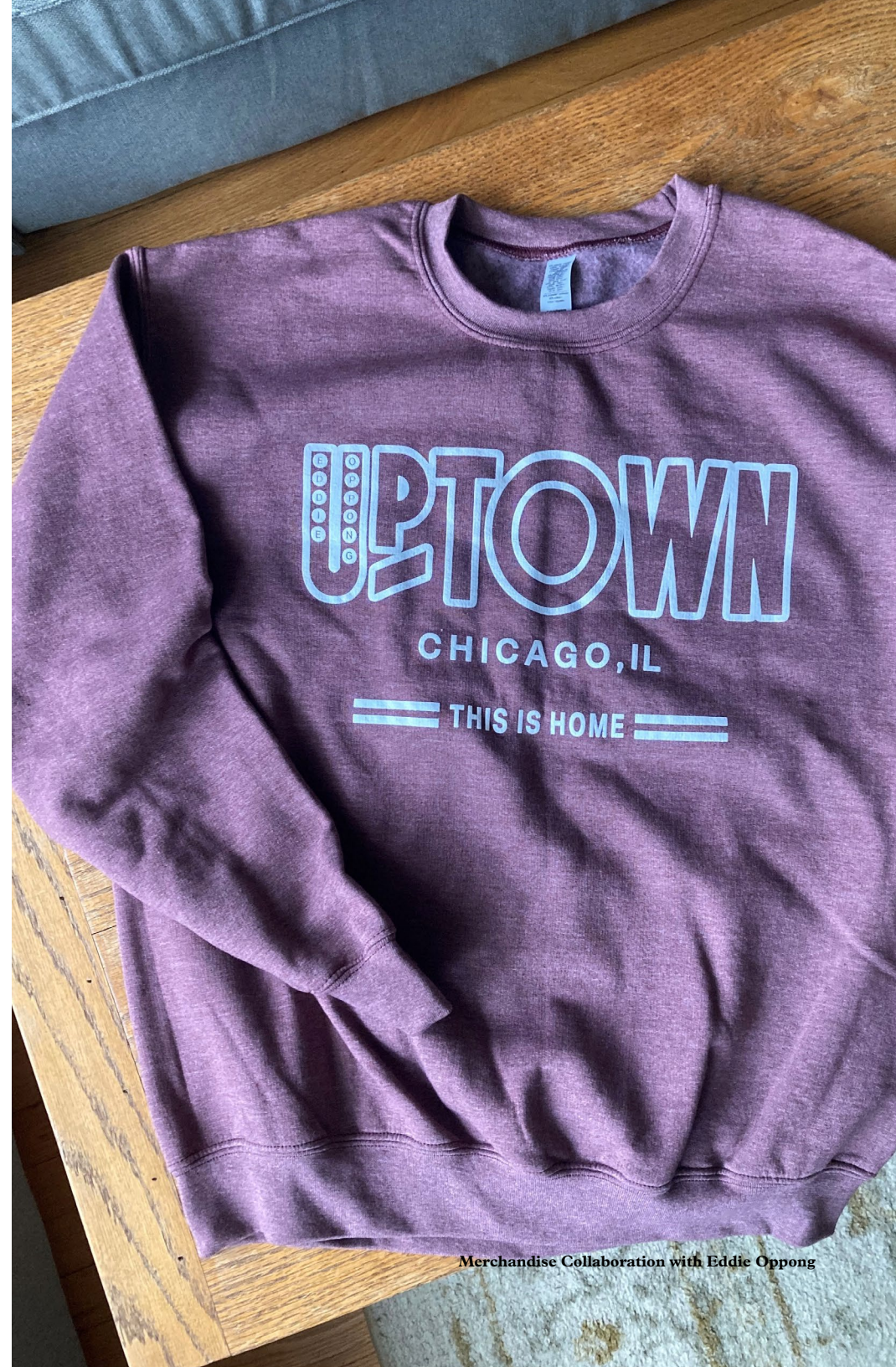
Merchandise Collaboration with Eddie Oppong

©2025 Uptown United | 773.878.1064 | exploreuptown.org