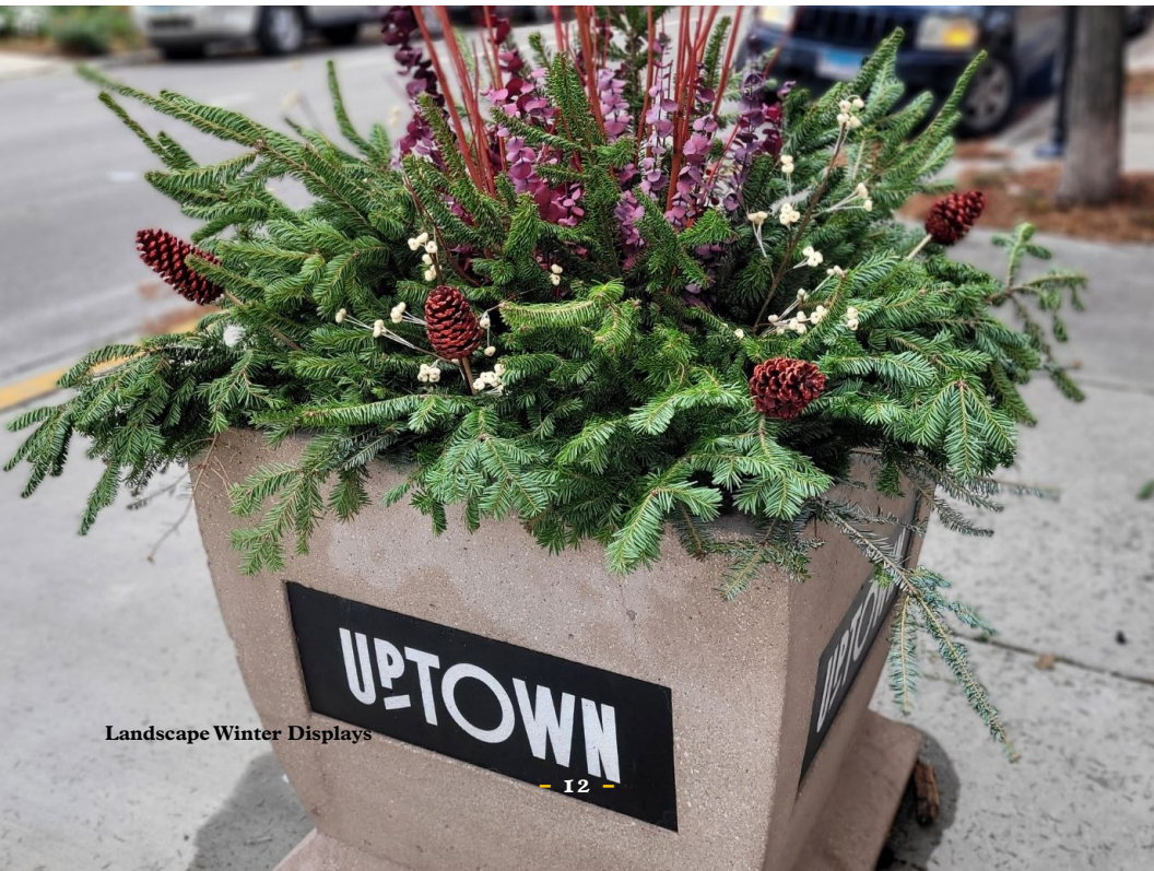
Landscape Winter Displays