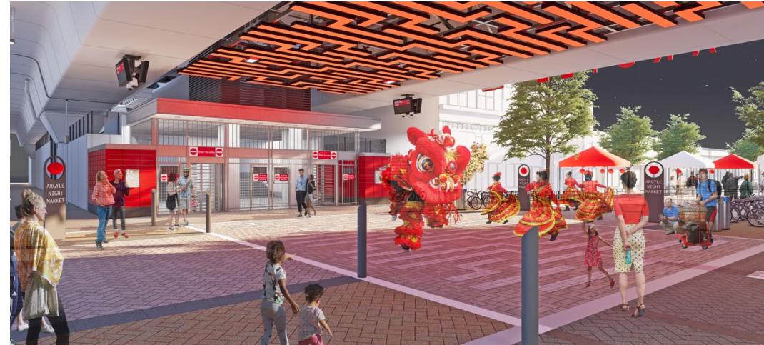
UNDER CONSTRUCTION: The Chicago Transit Authority (CTA) has begun the rebuild of four stations including Lawrence and Argyle as part of its $2.1 billion Red and Purple Modernization (RPM) Project.

More than $1.3 billion in public infrastructure investments have recently been completed, are under construction, or will be breaking ground soon in Uptown.