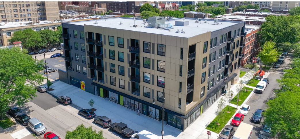
RECENTLY COMPLETED: The Portrait is a five-story, mixed-use development at Sheridan and Sunnyside which includes 59 residential units, 7,000 square feet of commercial space, and 35 parking spaces.