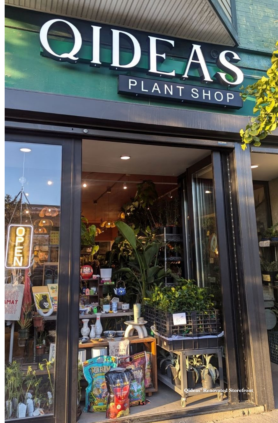
Qideas' Renovated Storefront