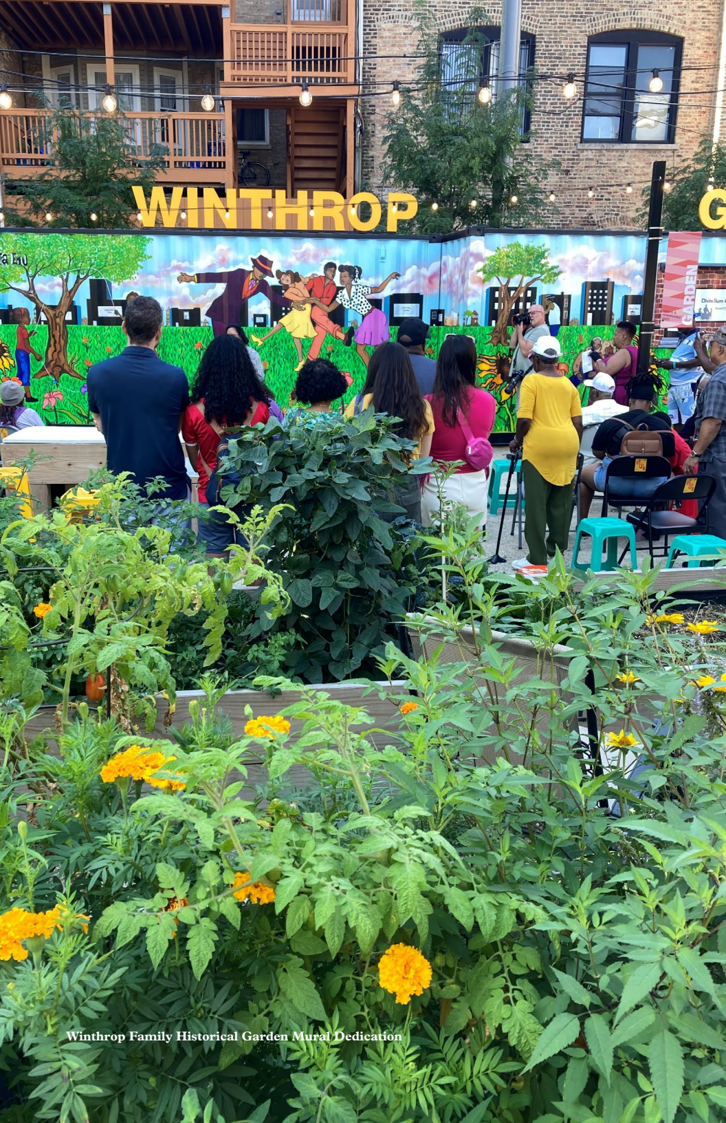
Winthrop Family Historical Garden Mural Dedication