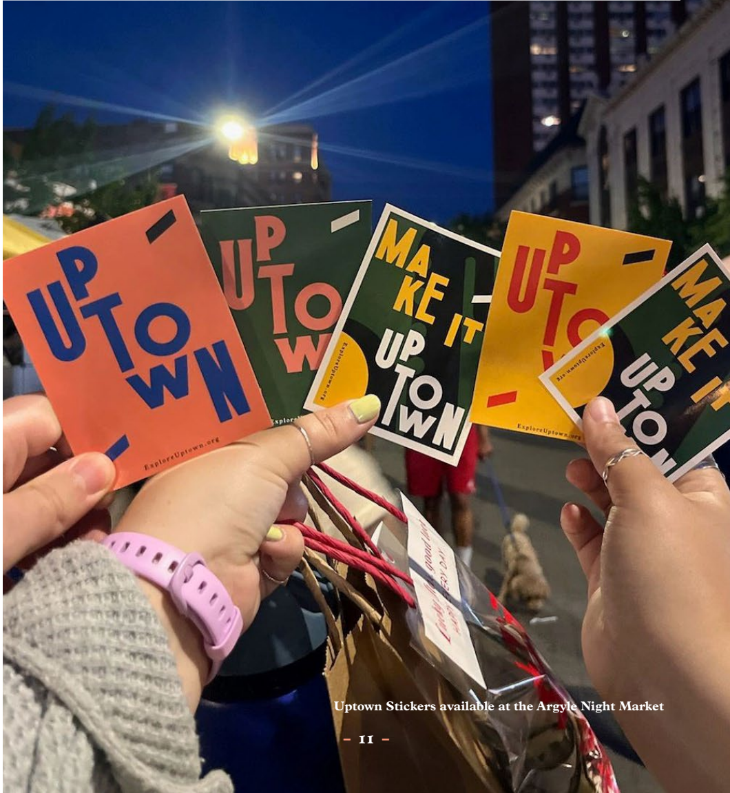
Uptown Stickers available at the Argyle Night Market

In 2024, Uptown United and the Uptown Chamber of Commerce reached an estimated 10+ million people through mentions of our programs in the media.