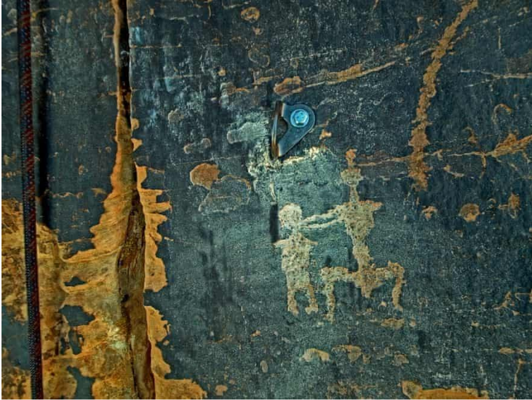
A bolt placed directly above a petroglyph near Moab.

“Nearly every climbing area in America is still connected to an Indigenous community today. [...] Climbing on certain formations has been, and continues to be, in opposition to the wishes of some tribal governments...” 48 Nonetheless, as rock climbing becomes increasingly popular, actual and potential damage to structures that have long-standing and important meaning for—some even being considered sacred to—Native peoples are increasingly at risk.